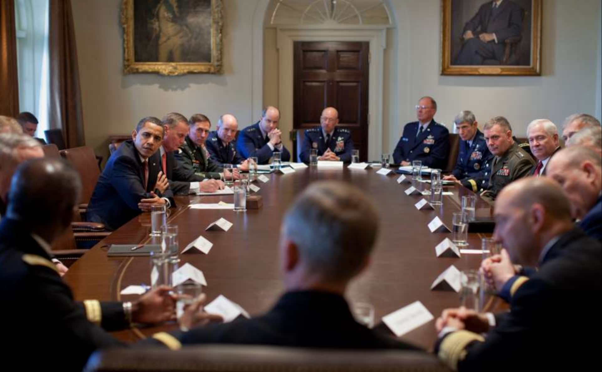
A War Cabinet